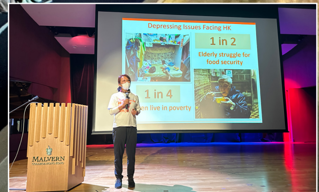
Students from Malvern College sitting in for a Food Waste seminar held by Foodlink