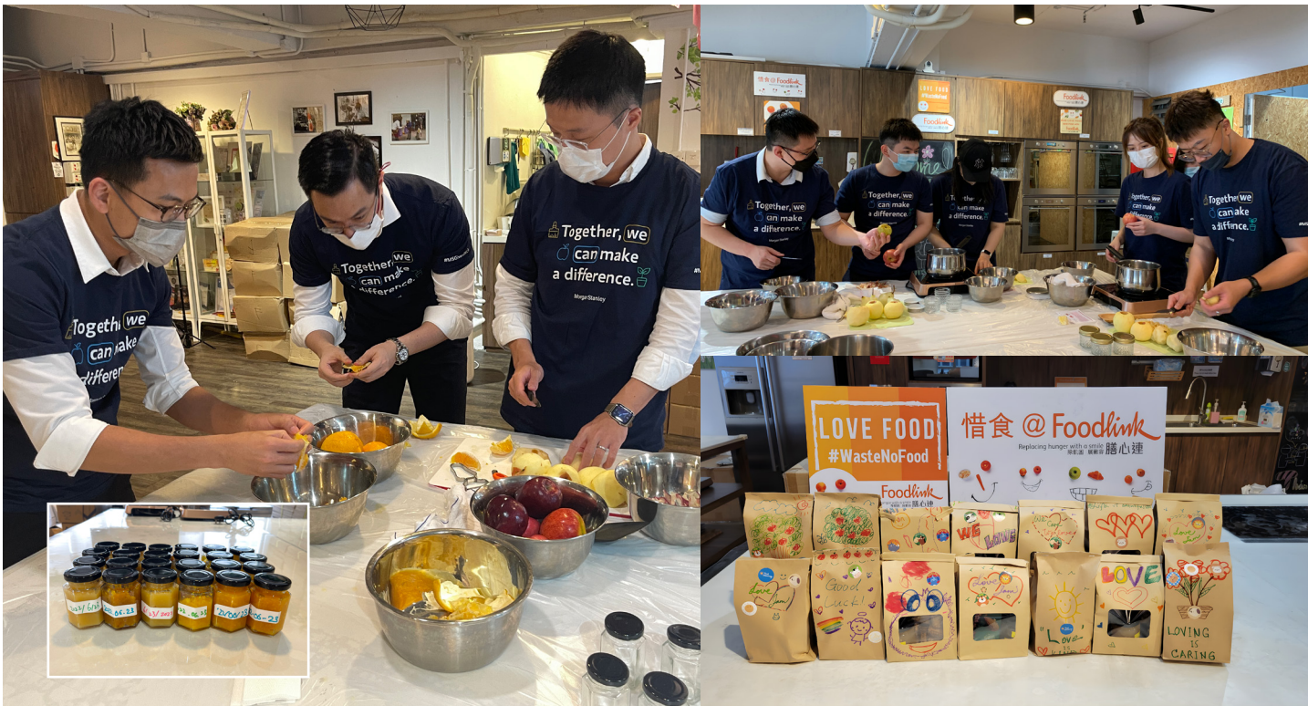
Bottom: Volunteers from Morgan Stanley made fruit jam to give to underprivileged children.