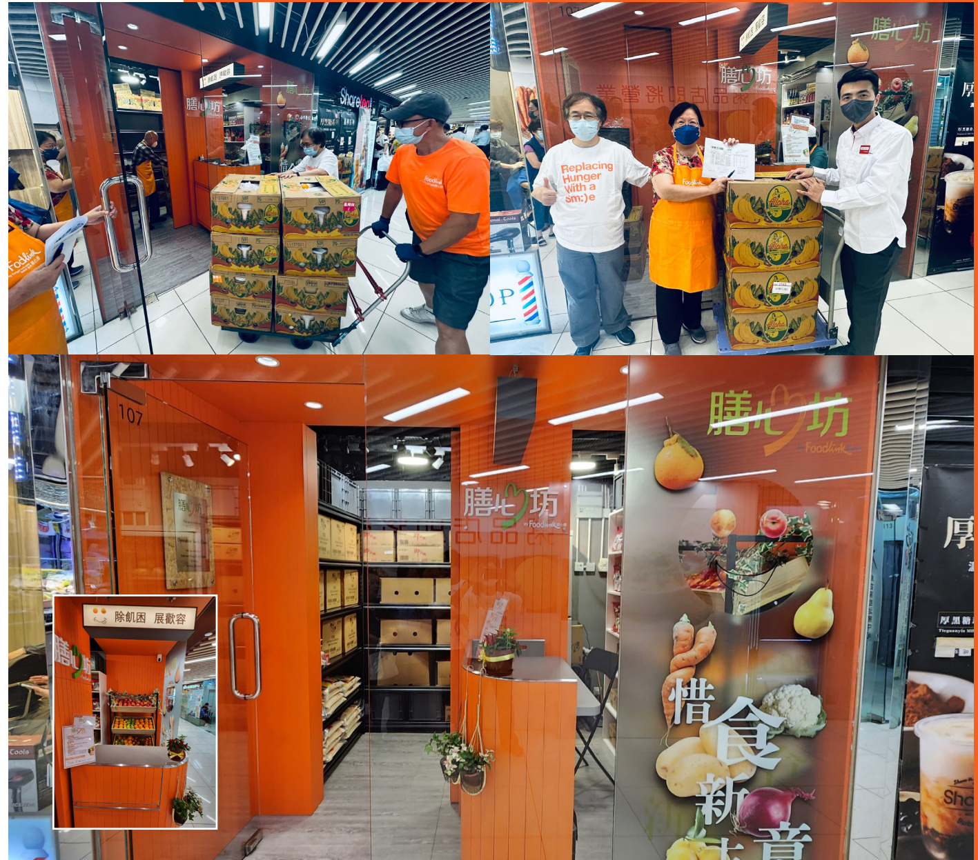
Right: Foodlink Mart in Kwun Tong

Foodlink is proud to be selected as one of the beneficiaries of Operation Santa Claus 2022. The funding supports the setup of a first of its kind surplus food distribution outlet, situated in a poorest district in Hong Kong. The Foodlink Mart aims to increase Foodlink's capacity to collect more surplus fresh produce from supermarkets and benefit more people in need.