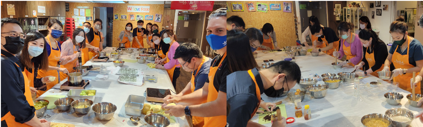
Top: DBS volunteers were diligently making nutritious energy bars for underprivileged children.