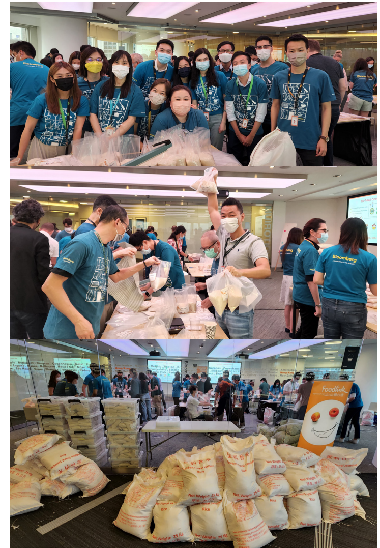
Mega Rice Packing by Bloomberg, engaged 350 volunteers and a total of 6,200 packs of rice