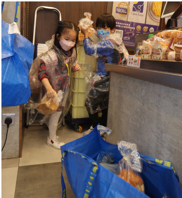
Right: Food Waste and Sustainability sharing session with students from Harrow International School.

Education empowers the young generation, and inspire them to think of how sustainability can alleviate hunger. Our responsibility is to raise their awareness of food waste challenge.